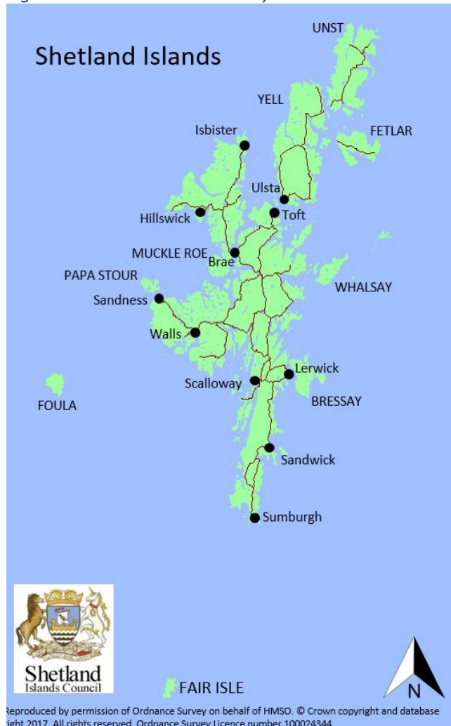
Figure 2 – Land area covered by LOIP